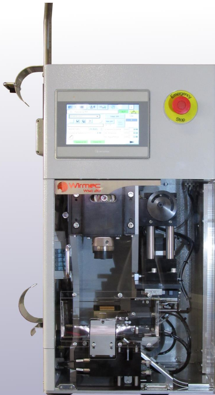
Wsc 20 Electronic stripper crimper